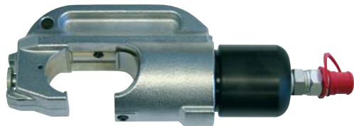
„KC42-12“ Art. 216005