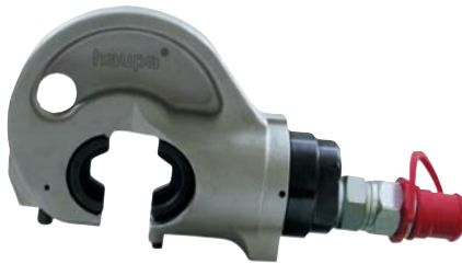
„KC25-12“ Art. 216004